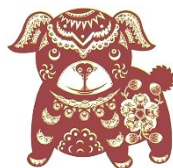
2018 Year of Dog

Friday 2/16 @ 3:30 p.m. Chinese New Year Party. Celebrate the Chinese New Year with us at the Library! Join us for stories, songs, and crafts as we ring in the year of the Dog! All ages. No registration required.